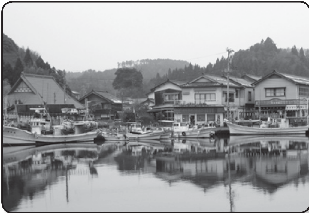
A small fishing village on the Noto peninsula north of Kanazawa.