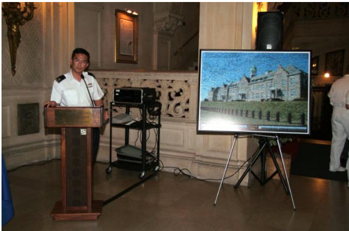
NSC Class President unveils Class Memento.